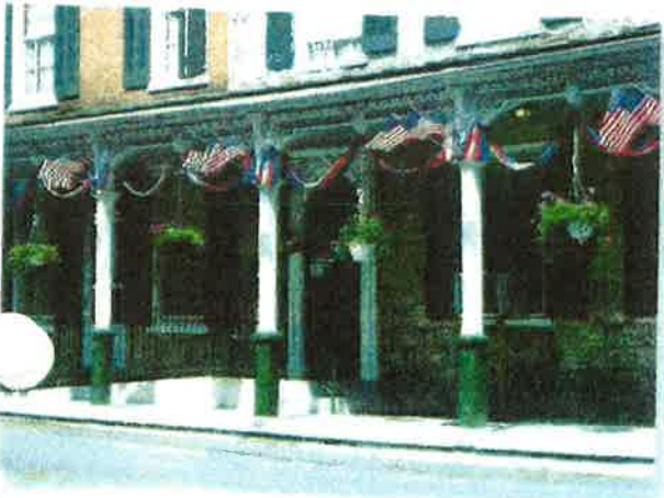
Banners can be represented by flags. Many cultures include flags in ceremonies. Flags and banner drapery often include colors that hold specific meaning