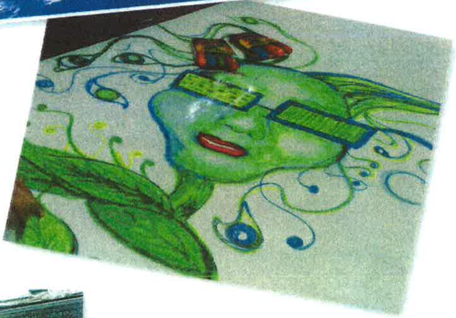
Artwork by student from Chicago Public Schools