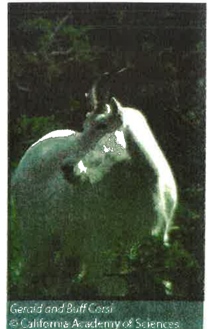
Genaid and Buff Corsi © California Academy of Sciences