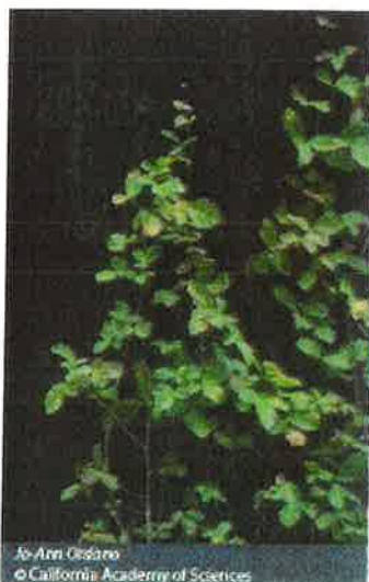
Jo Ann O'Shano © California Academy of Sciences

LOCATION: The chaparral biome is found in small sections of most continents, including the west coast of the United States, the west coast of South America, the Cape Town area of South Africa, the western tip of