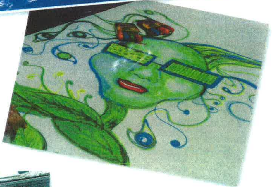
Artwork by student from Chicago Public Schools.