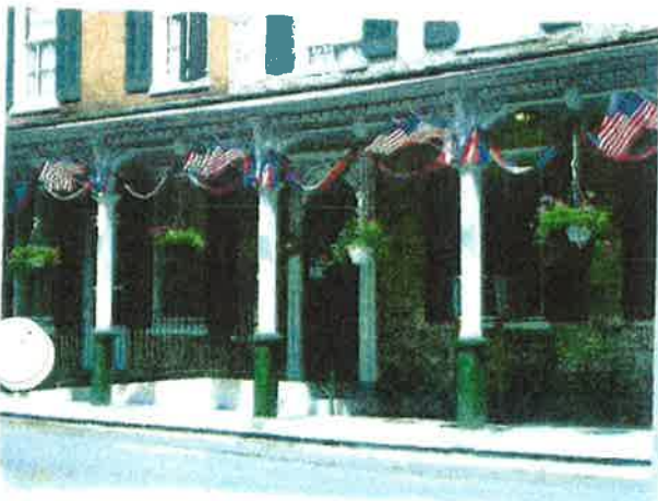
Banners can be represented by flags. Many cultures include flags in ceremonies. Flags and banner drapery often include colors that hold specific meaning.