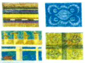
Adorned and Rente Cloth Designs Rust Sandy sized Circles from marbles, outh 12 x 18" Private Collection

Challenge gifted students to write short stories or articles based on their cultural heritages. Study and debate current issues such as immigration, languages, housing, and human rights.