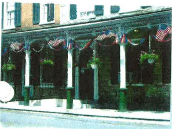
Banners can be represented by flags. Many cultures include flags in ceremonies. Flags and banner drapery often include colors that hold specific meaning.