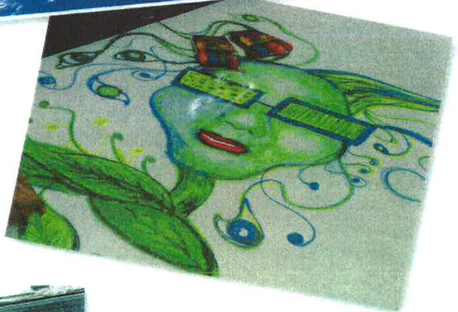
Artwork by student from Chicago Public Schools.