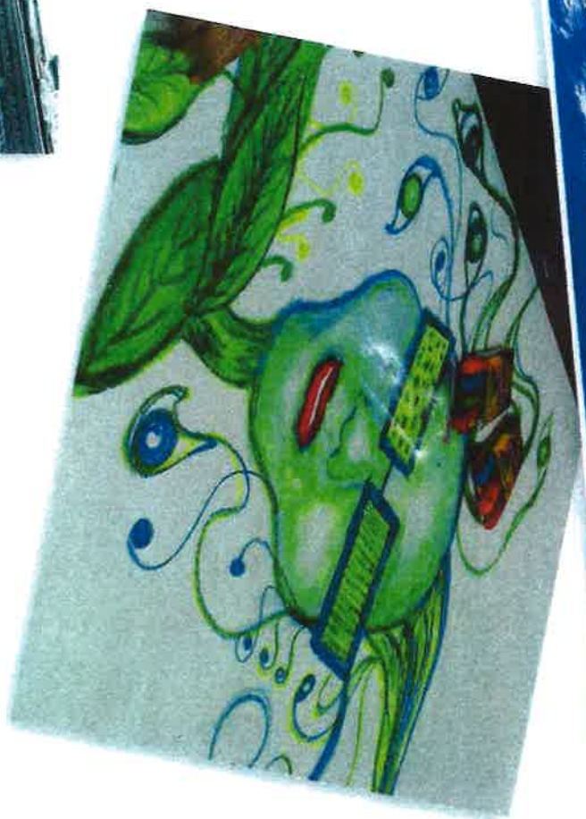
Artwork by student from Chicago Public Schools.

Banners can be represented by flags. Many cultures include flags in ceremonies. Flags and banner drapery often include colors that hold specific meaning.