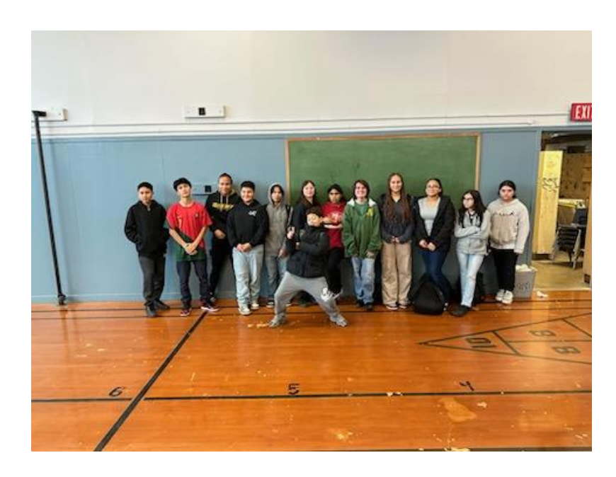
Football Championship Team