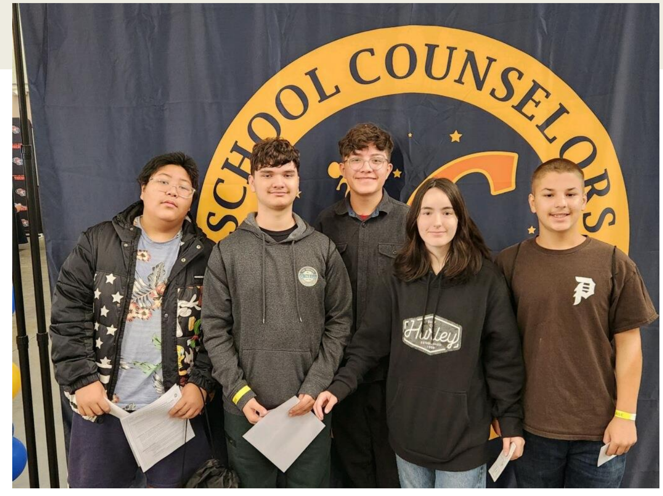
8<sup>th</sup> Grade Students at the CTE Field Trip showing their Commodore Pride!